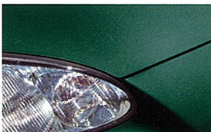
Racing Green Mica (18J).