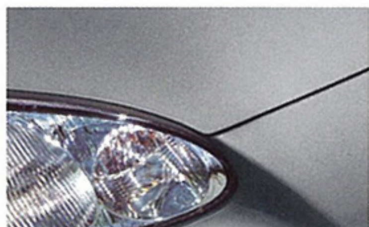
Titanium Grey Metallic (29Y) (only available on 1.8i Sport model).