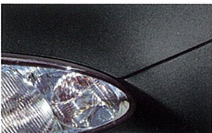
Brilliant Black (A3F).