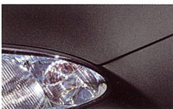
Radiant Ebony Mica (28W).