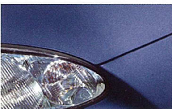
Strato Blue Mica (25E).