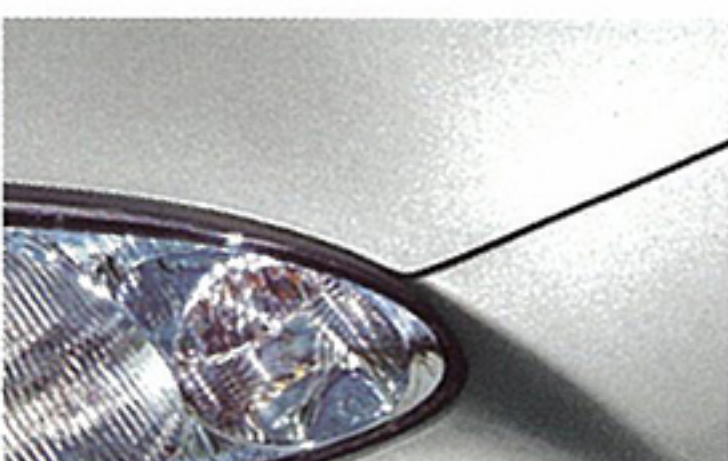
Sunlight Silver Metallic (22V).