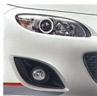
CRYSTAL WHITE PEARLESCENT*