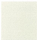
Crystal White Pearlescent (34K)