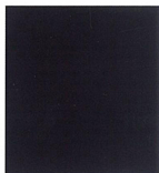
Radiant Ebony Mica (36W)