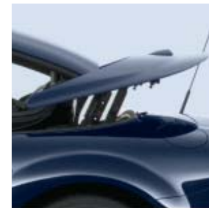
Power-retractable hardtop in body colour.