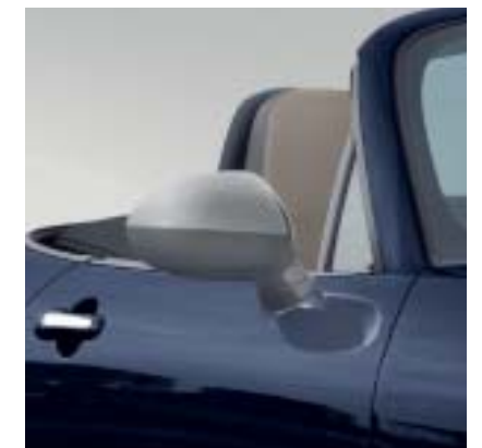
Bright silver door mirrors.