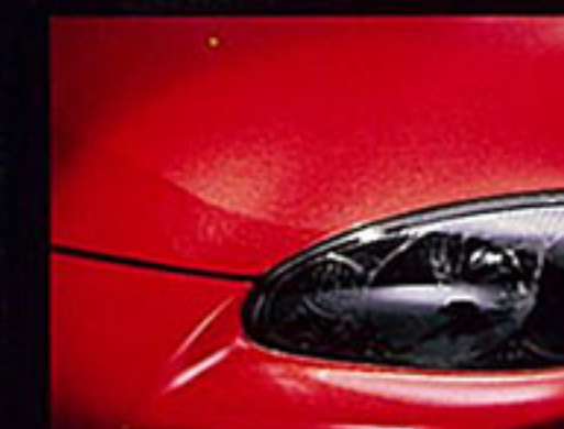
Velocity Red Mica

At Mazda, we take safe driving seriously. Which is why all of the photographs in this brochure were taken on a closed course with a professional driver.