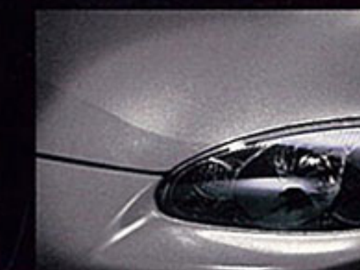
Titanium Gray Metallic