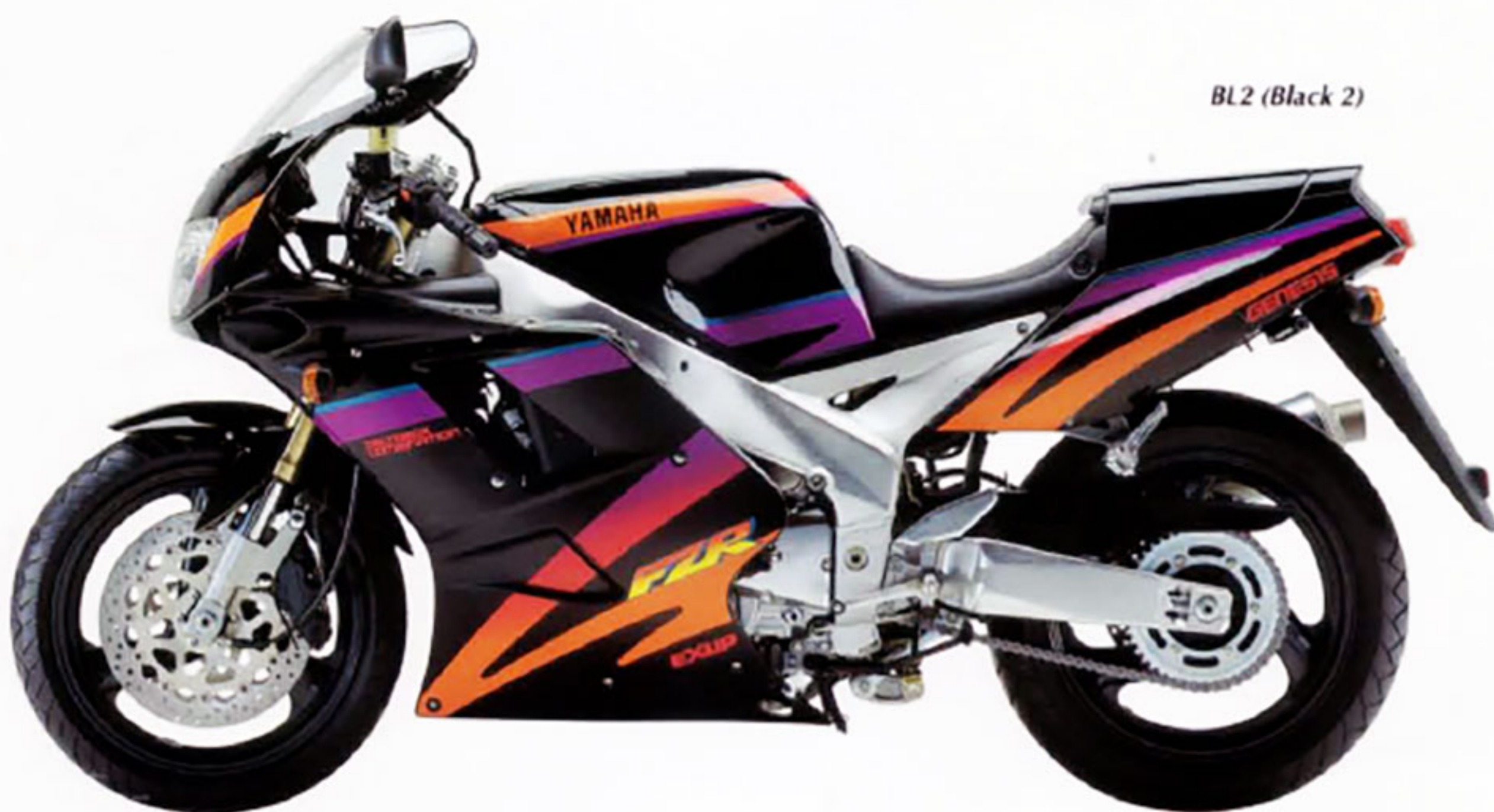
BL2 (Black 2)