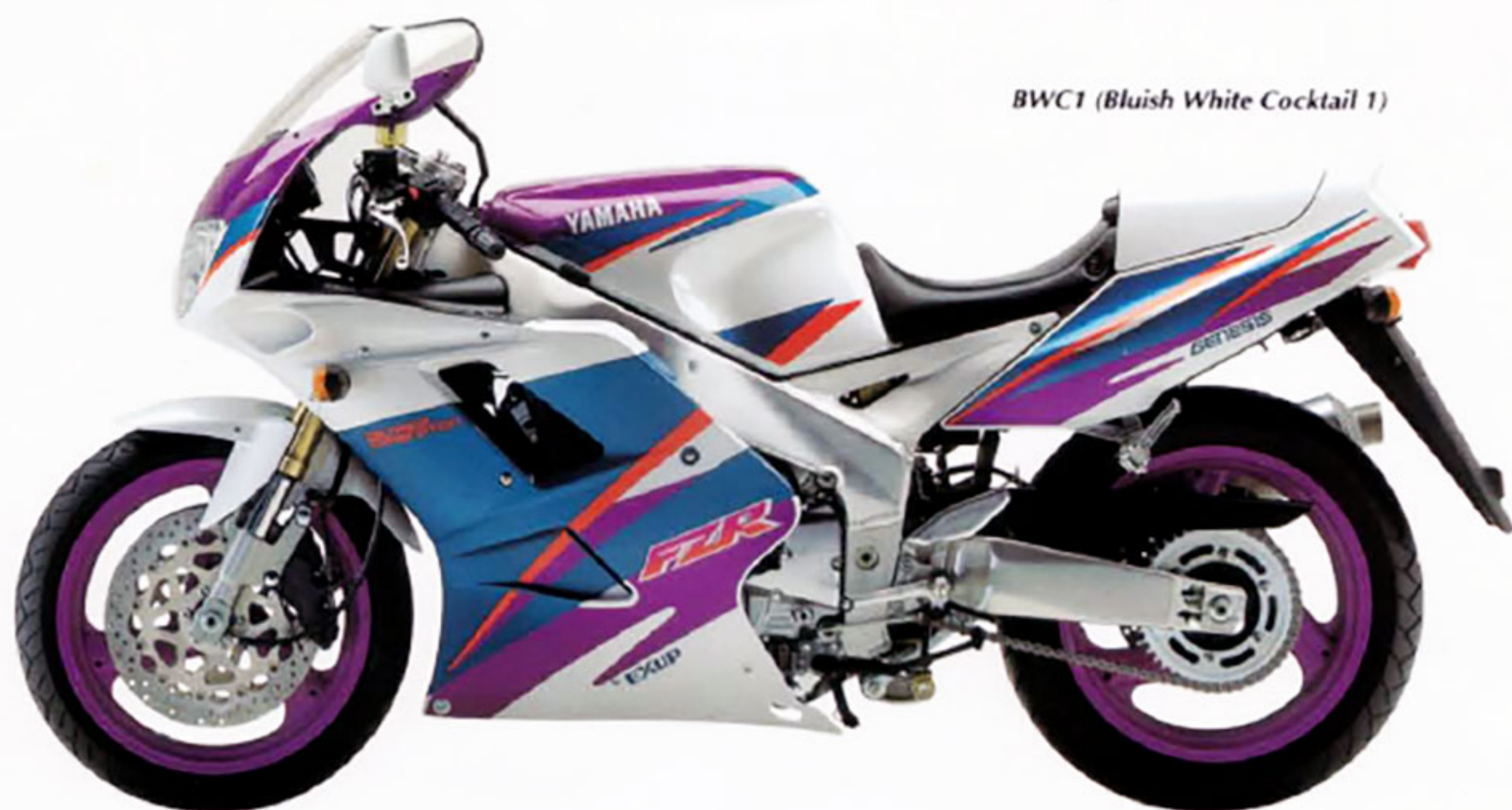
BWC1 (Bluish White Cocktail 1)